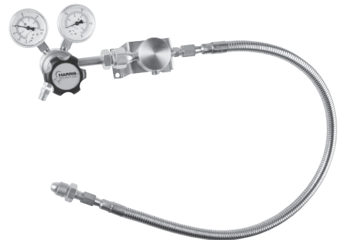
Shown with Model 741 Regulator Attached